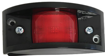
GIRARDIN SIDEWALL MARKER LIGHTS