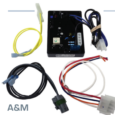
A&M SYSTEMS DOOR CONTROL MODULE

Most common entry door supplier, single unit replaces existing A&M module models